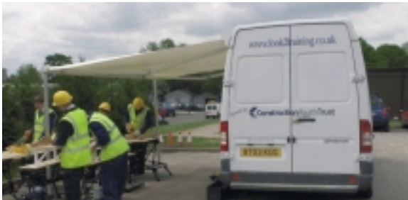
One of three Mobile Construction Classrooms partly funded by CYT.