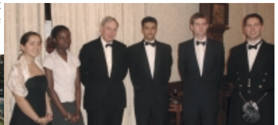
CYT Bursary Students with Trust Patron HRH The Duke of Gloucester at last year's concert.

PS - don't miss our special "early bird" offer for bookings received before 29th September!