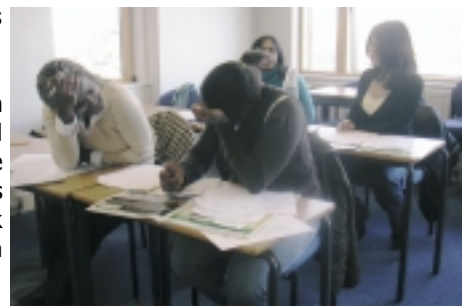
Students at the first confidence & employability course.

If you are a student or local employer keen to be involved, we would be delighted to hear from you. Please contact Emily English on 020 7227 4565.