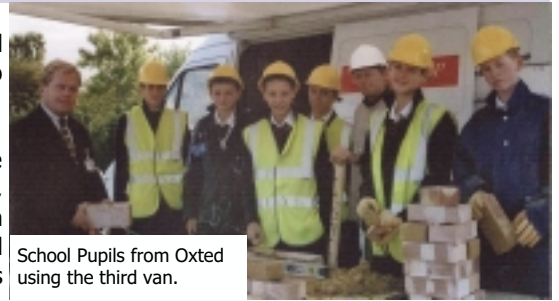
School Pupils from Oxted using the third van.

Mobile construction classrooms were the brainchild of Surrey EBP, whose initial pilot in 2004 was sponsored by BAA. The addition of an M & E van, an idea originating from CYT, brings the fleet total to four, three of which have been supported by the Trust. This van's alternative syllabus will highlight an area of the industry less well known to students, but no less in need of new blood.