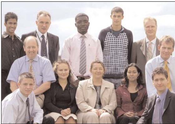
T5 bursary student cohorts 1&2 with Trust, BAA, CITB and placement company representatives

Congratulations to the Construction Youth Trust/BAA joint bursary students who secured paid summer placements as a result of the bursary lunch networking event held on Tuesday 12 th April. The students, accompanied by Trust and BAA staff members and a number of construction company representatives, enjoyed lunch at the Renaissance Hotel, finishing with a tour of the Terminal 5 site.