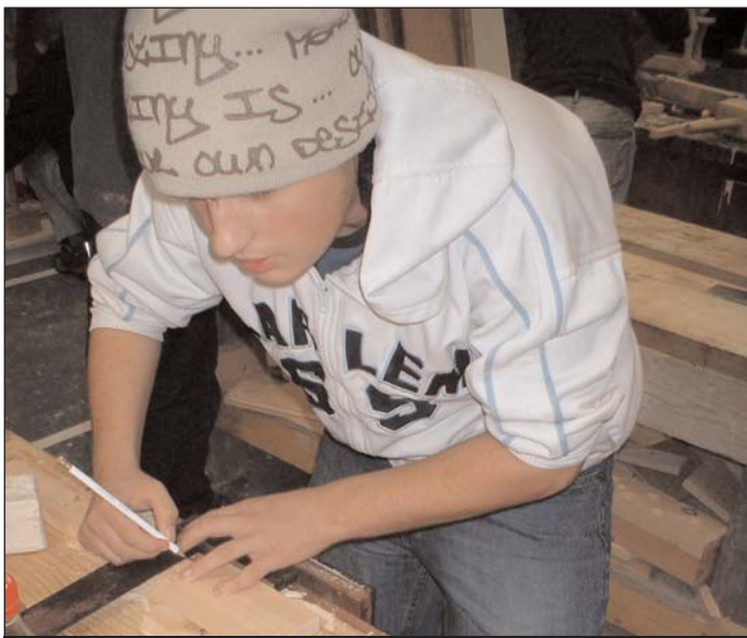
Unit 19, Port Talbot

The Lighthouse Club is currently in its 49th year. For more information please visit www.lighthouseclub.org .